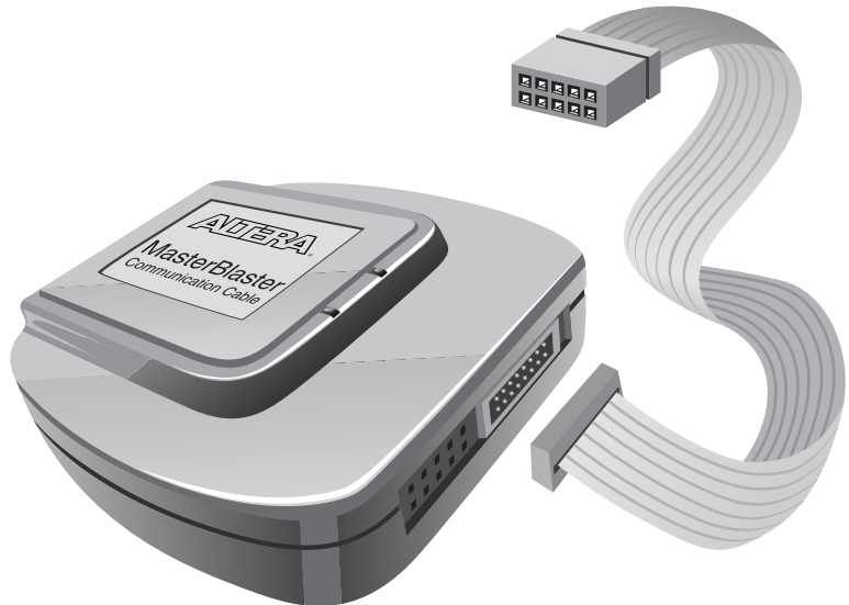
Figure 1. MasterBlaster Serial/USB Communications Cable